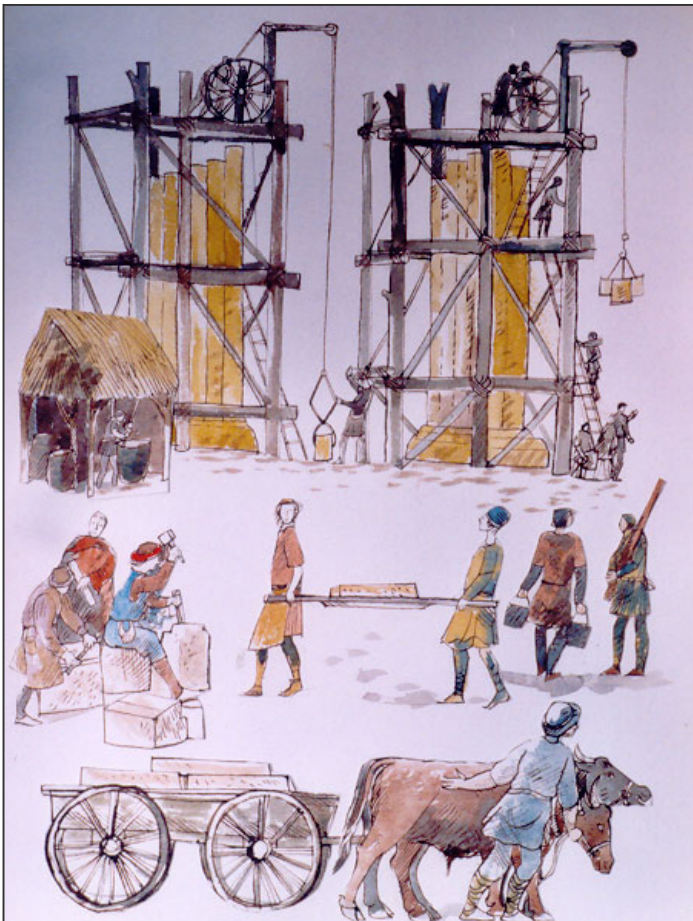
Skilled builders & masons came to Dornoch to work on the Cathedral.

Building this new cathedral must have been very difficult. There were few local inhabitants to help with its construction, so skilled builders and masons must have been brought into the area from other parts of Scotland. It seems likely that Gilbert used sandstone from local quarries and glass from Cyderhall to help build his magnificent new cathedral. Today only the four central pillars and arches of the cathedral are original: time, warfare and the elements having taken their toll of the building over the centuries.