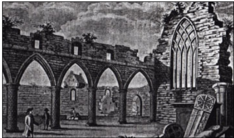
Cordiner's Sketch of the Cathedral Nave (c.1776).

Although additional repairs were carried out in the 1920s, the Cathedral that you see today is largely the work of the Countess of Sutherland, and bears little resemblance to the original 13 th century building. Nevertheless, at least today the congregation can sit in comfort and not get soaked by the rain or buffeted by the wind!