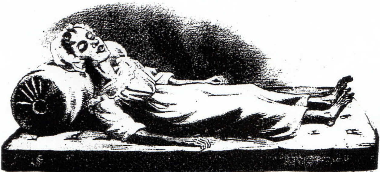
The body of a cholera victim.

The eyes, surrounded by a dark circle, are completely sunk in the sockets, the whole face is collapsed, the skin is livid...The surface of the skin is covered with cold sweat, the nails are blue and the skin of the hands and feet are corrugated as if they had been long steeped in water...The voice is hollow and unnatural...the suffering of the patient is sometimes excruciating. The patient usually dies after this stage.