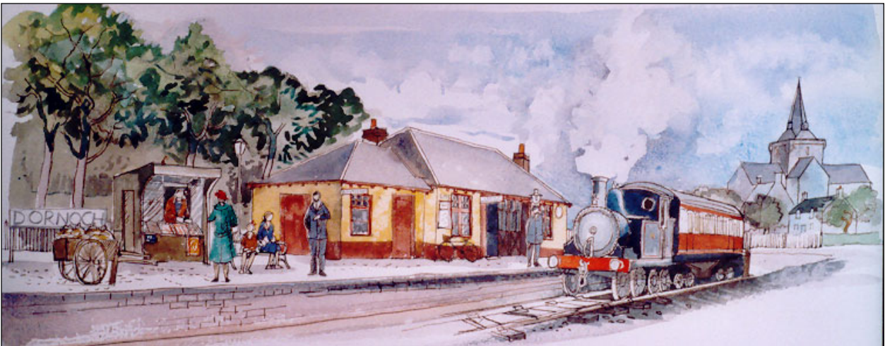
Dornoch became far more accessible to visitors from all over the United Kingdom in 1902, when the Dornoch Light Railway opened. This branch line ran from Dornoch to the Mound where it connected with the main Highland Railway.

Many other improvements took place at this time. It was the hope of the town council that Dornoch could be turned into an attractive tourist destination, particularly as the new golf course was attracting a great deal of attention. From 1898, the presence of Andrew Carnegie at nearby Skibo Castle certainly helped Dornoch's image as a tourist destination for the wealthier classes. Housing was improved, with many locals building second homes to rent out to visitors.