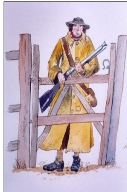
Dornoch's 'cholera picket' prevented people from entering the town.

In 1832 the citizens of Dornoch patrolled the town's boundaries, preventing anyone from an affected area entering the town. This measure proved extremely effective as there are no recorded deaths from the disease in the town's records, although fear of cholera did lead to one unfortunate incident when a man suffering from symptoms similar to those of cholera died and was buried in a lonely grave beyond the town limits.