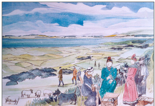
Dornoch attracts up-market tourists in the early 20 th century.

This is still the case today, and Dornoch's popularity as a holiday and golfing resort has spread throughout the world. Changed days indeed from a time when pigs disturbed the dead and raw sewage floated in the burn and ran through the narrow streets and lanes of the town!