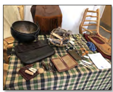
Catu display at Fibre Fest

Members of Catu will learn the crafts and skills to make their own basic kit and portray life in our era. All clothing and equipment is researched and must be authentic and of suitable quality. Members can choose a role and adopt a character with name, rank and appropriate skills. Other members may prefer to concentrate on crafts such as spinning, weaving, embroidery, woodwork, pottery, basketry, cooking food of the period, smith craft or music.