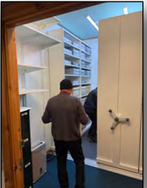
re-stocking . . .